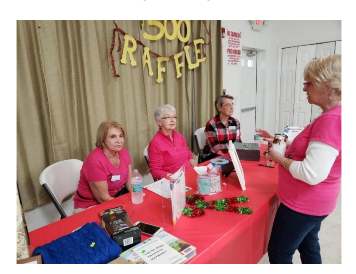
$500 Cash Raffle