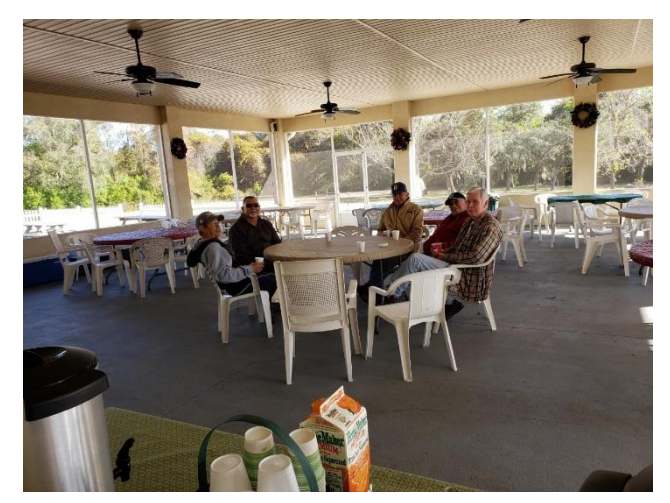
The first for morning coffee and pastries.