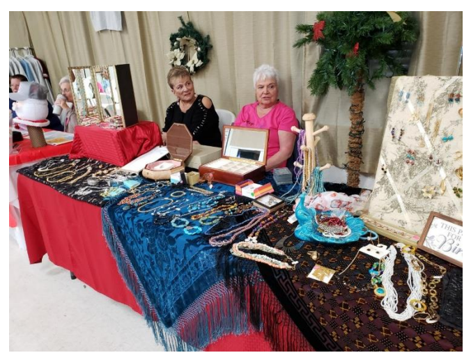
2<sup>nd</sup> Hand Rose