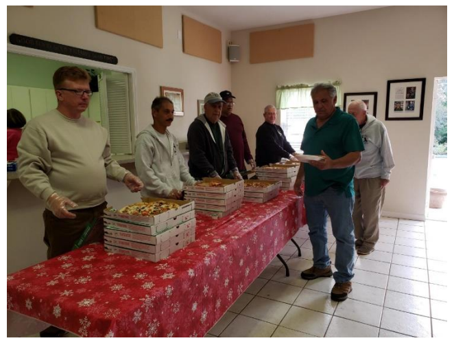
The men serve pizza before the auction.