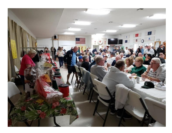
A nice crowd

Thanks to all who donated toward the Pick-A-Prize raffle.